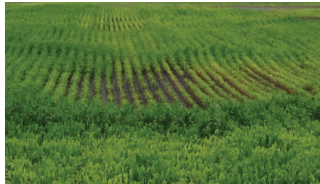
Example of N loss due to unpredictable weather

The 2015 planting season was a struggle for many growers across the corn belt. Several thousand acres didn't get planted due to all of the rain.